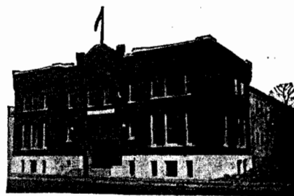
MEETINGS AT ARMORY, CROOKSTON

Crookston Series, Vol. 16, No. 2. January, 1923. Published by the Northwest School and Experiment Station, Crookston, Minnesota, and entered at the Post-Office at Crookston as second class matter.