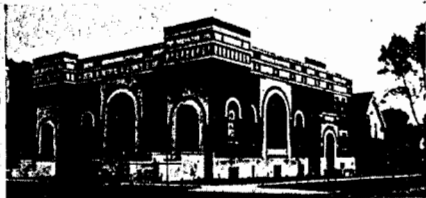
MEETING PLACE OF WOMEN'S MEETINGS

Crookston Series, Vol. 16, No. 2. January, 1923. Published by the Northwest School and Experiment Station, Crookston, Minnesota, and entered at the Post-Office at Crookston as second class matter.