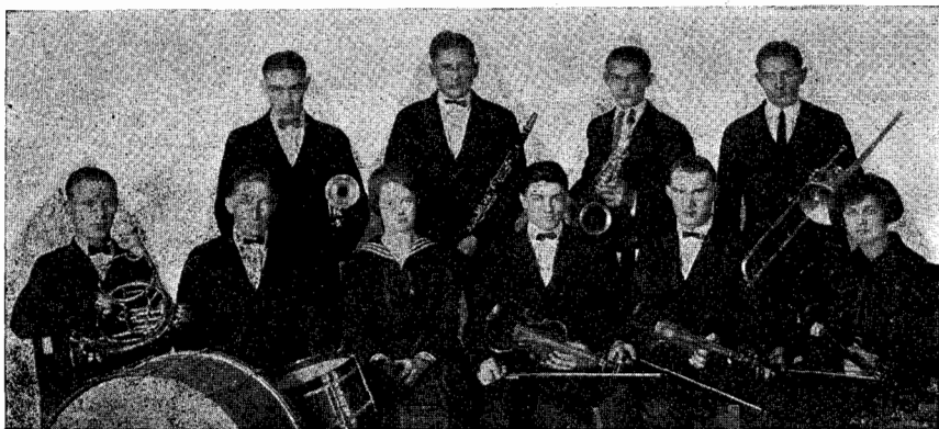
NORTHWEST SCHOOL MUSICIANS