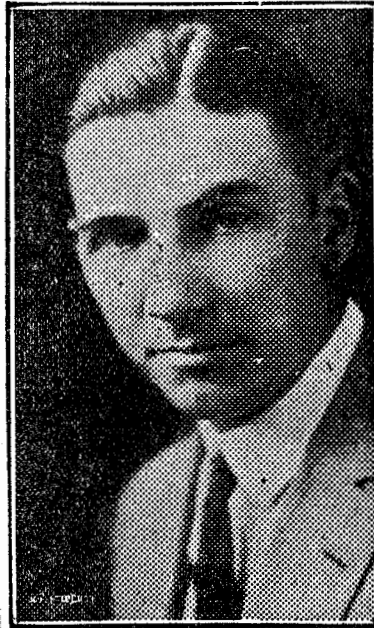
GOVERNOR FLOYD B. OLSON Governor of the State of Minnesota, who will speak Thursday evening, February 11