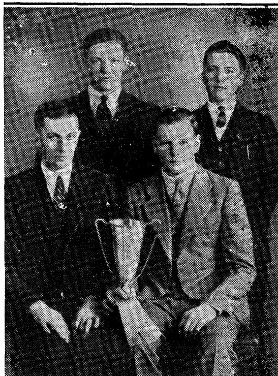
Central School Awarded Livestock Judging Trophy