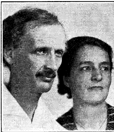
DR. AND MRS. JEAN F. PICCARD

The Northwest School tree planting project is gaining momentum to such an extent that students are no longer content to plant but a single tree but are planting trees in increasing numbers. Sixty-nine Freshmen and new students planted Northwest School trees in 1936. Thirty-five of this number planted from 2 up to 1014 trees each. A stand of 60.6% on the 2681 trees planted in 1936 was most qualifying, considering the draught and hot weather conditions which prevailed