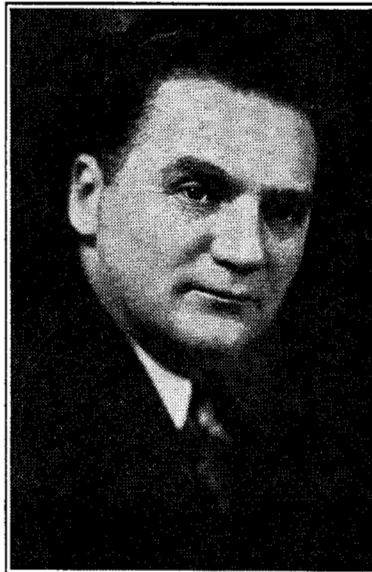
SENATOR GERALD P. NYE Washington, D. C., will speak Wednesday evening, February 10

A complete summary of each day's program will be found elsewhere in this issue of the Northwest Monthly. Additional copies of the Northwest Monthly or the official program may be obtained upon request.