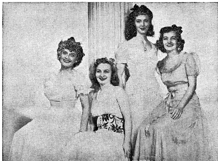
"The Victory Belles"