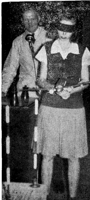
LYCEUM PROGRAM — JANUARY 4