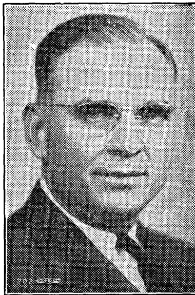
GOVERNOR EDWARD J. THYE