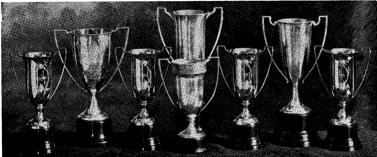
Crops trophies awarded by the Red River Valley Development Association for championship exhibits of corn, small grains, legumes, potatoes and flax. They are to be awarded at the Red River Valley Winter Shows, Crookston, February 5-9.