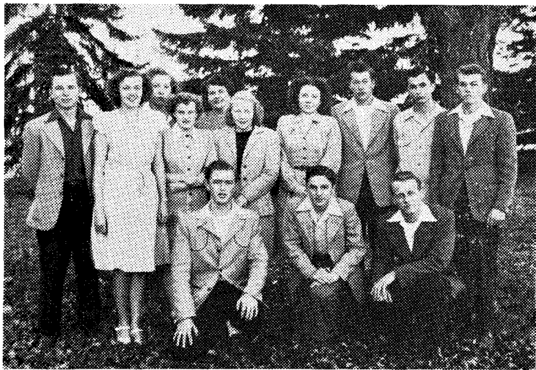
Cast for Operetta "Tune In"