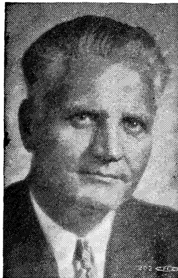
LUTHER W. YOUNGDAHL , The Honorable Luther W. Youngdahl, Governor of the state of Minnesota, will speak at the Red River Valley Winter Shows on Thursday evening, February 26.