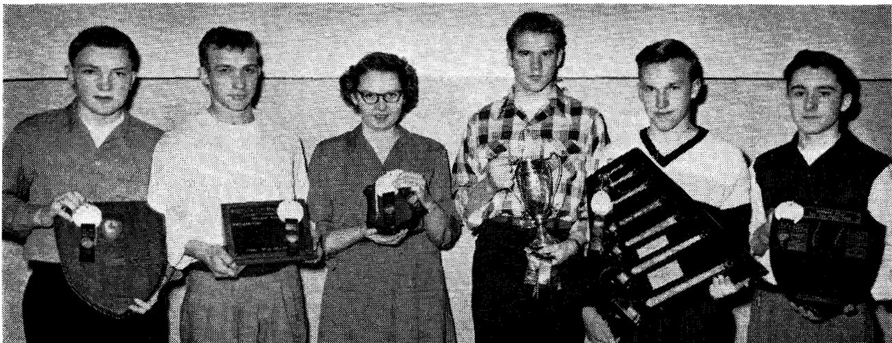
Northwest School Students Receive Home Project Awards