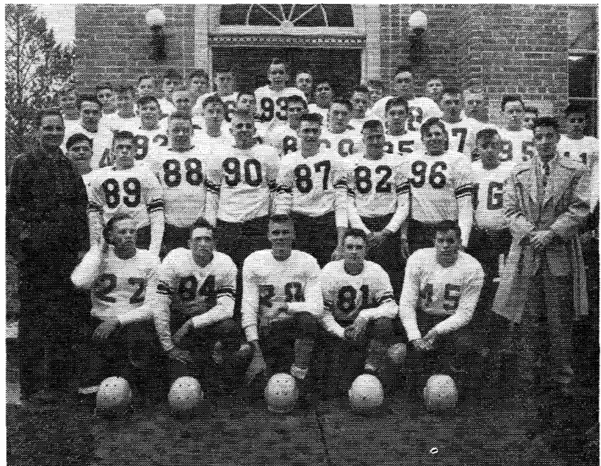
1951 Northwest School Football Champions