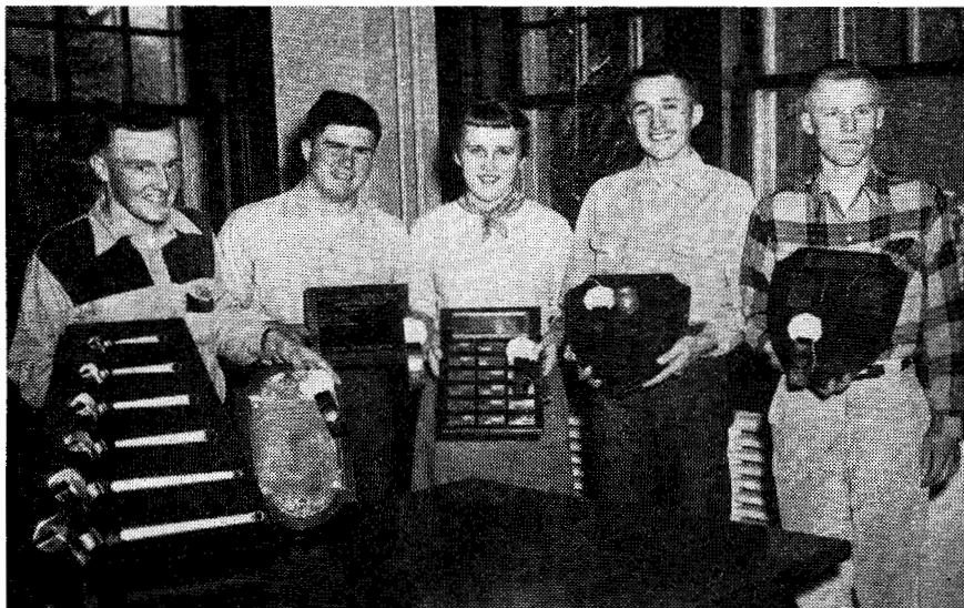
Plaque Winners for 1953 Summer Home Project Work