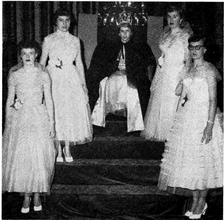
HOMECOMING QUEEN AND HER ATTENDANTS

West Central Aggies football team members and coaches were guests of (continued on page 4, col. 3)